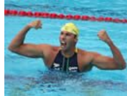
Grant Hackett, AUS 7:38.65