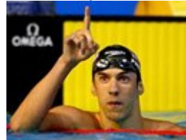
Michael Phelps, USA 4:06.22