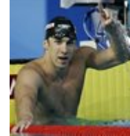
Michael Phelps, USA 1:52.09