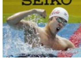
Kosuke Kitajima, JPN 2:07.51