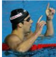
Michael Phelps, USA 1:54.98