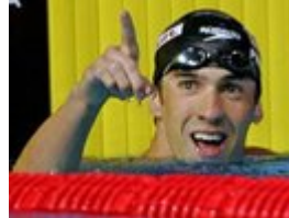
Michael Phelps, USA 1:43.86