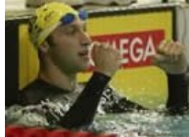
Ian Thorpe, AUS 3:40.08