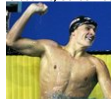
Ryan Lochte, USA 1:54.32